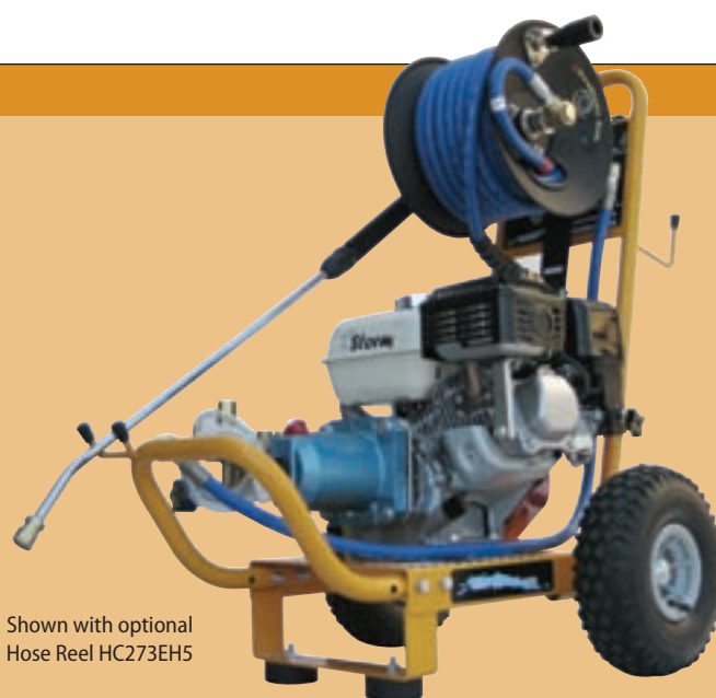
Shown with optional Hose Reel HC273EH5