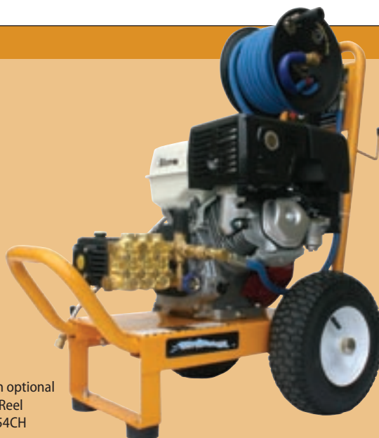
Shown with optional Hose Reel HGP354CH