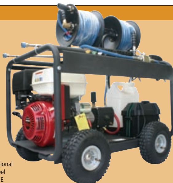
Shown with optional Dual Hose Reel HGP255LHHE