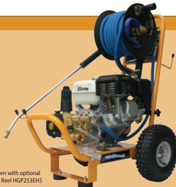
Shown with optional Hose Reel HGP253EH5